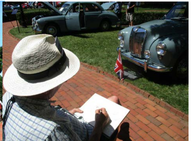
Artist doing pen and ink drawing