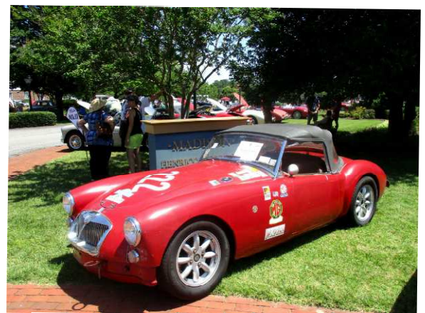
My MGA 1600 Mk II "222" at the car show