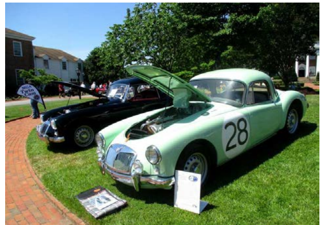
MGA Coups on the lawn