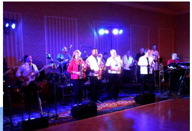
KOS Band at the Friday night