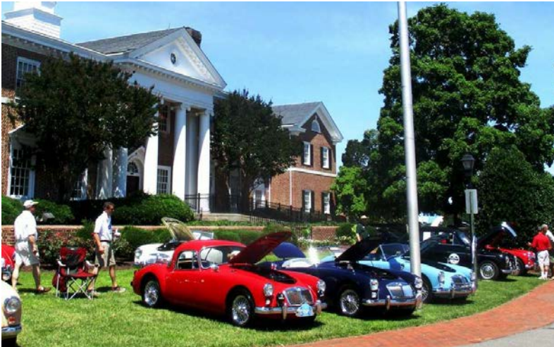
MGAs on display in front of the Virginia Crossing Hotel mail building