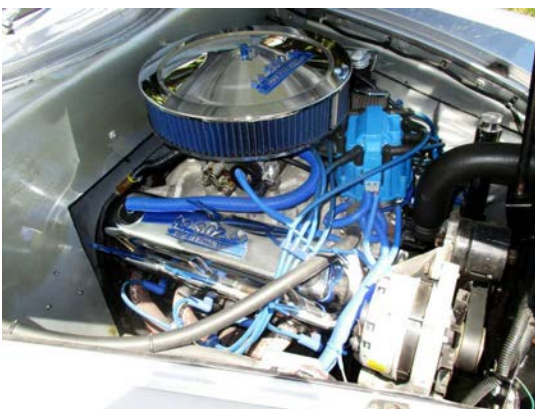
Magneite with 305 Ford V-8