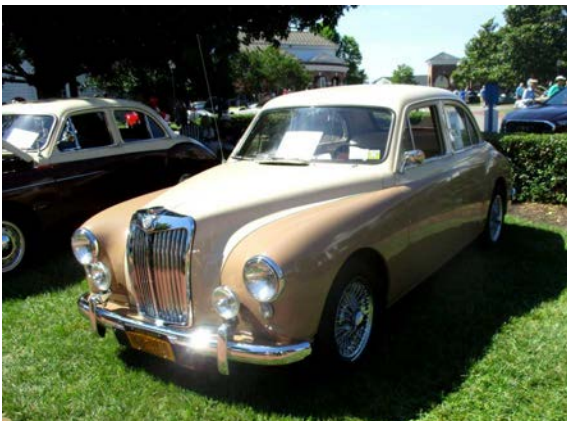
. Dan Suter's Magnette at the car show

I've been to a number of these events and on balance, this may have been the best GT I've been to. It had everything: good tech sessions, great tours, wonderful ladies events, a Friday night party with a fantastic band and a very well done Saturday night awards banquet with good food. If that wasn't enough, the Saturday car show had many well restored cars in a spectacular setting that was second to none. GT- 43 was outstanding in every way.