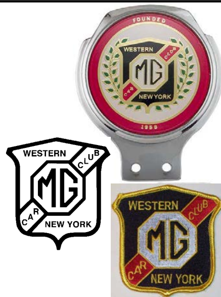
Sticker Car Badge Patch

Also available is a wide selection of clothing items (shirts, jackets, ect.) embroidered with the club logo. Prices shown are for members only.