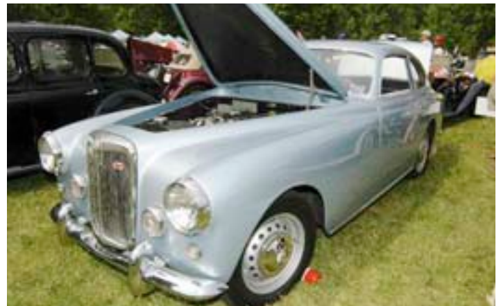
Arnolt MG—TD chassis with custom body by Bertone of Italy