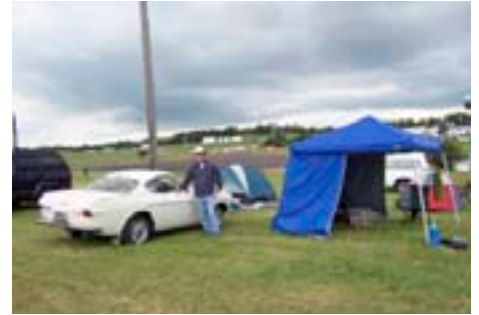
No wake up call needed