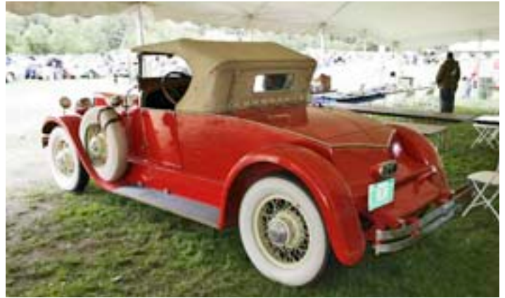
The Hildene Franklin