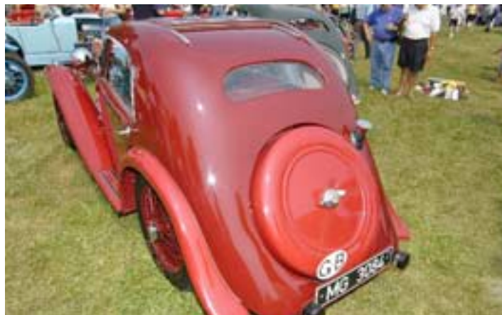
MG PA Midget Airline Coupe