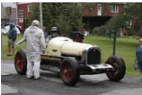
Hudson Indy car