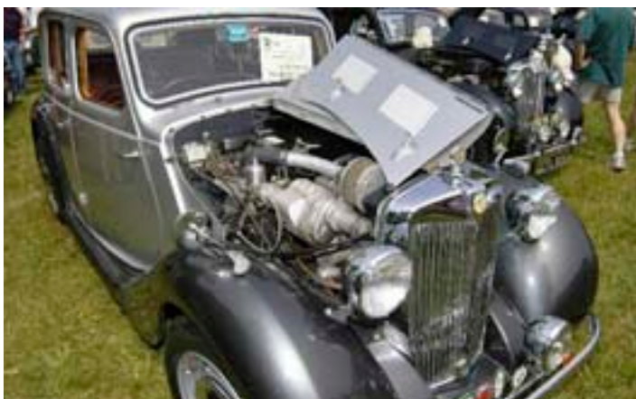
1950 MG YA Saloon with a period supercharger