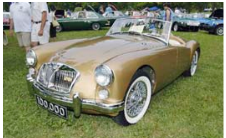
The 100,000th MGA made