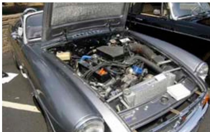
Leon's Favorite MG Motor