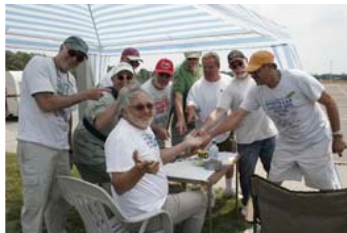
"Wally gets more respect!"