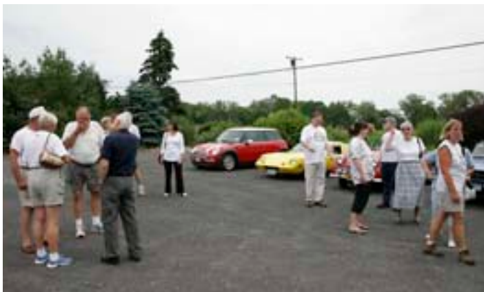
First stop, stretch your legs and have lunch.