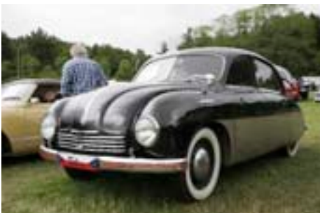
A Tatra . . .