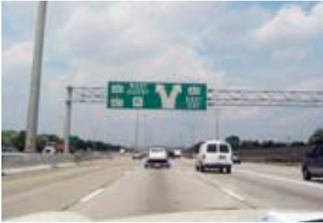
Ouest or Est?