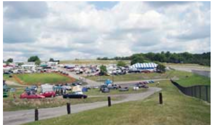
It's a Great Day for Motor Racing!