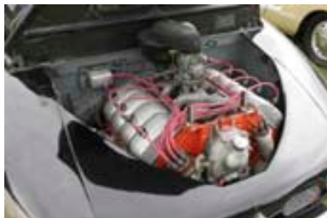
with a rear engine V8