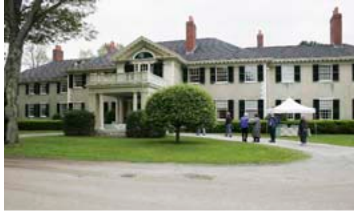
Robert Todd Lincoln's Hildene Mansion. Manchester, Vermont