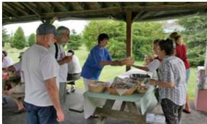
A great summer time lunch of barbecued chicken