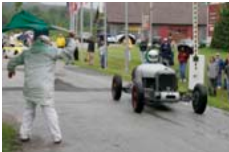
A flathead Ford gets the green flag . . .