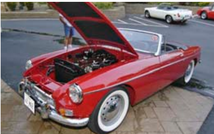
Early MGB concours winner