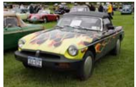
and what's a B without flames?