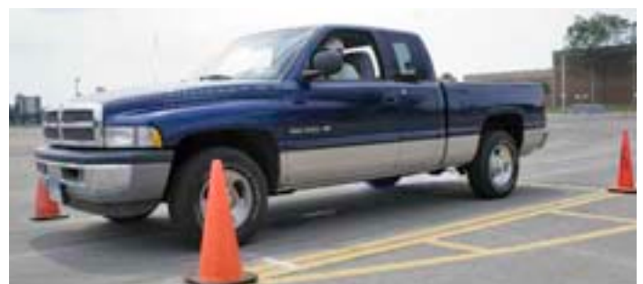
Who is that man behind the mirror?