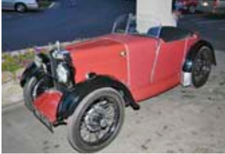
M Type Midget