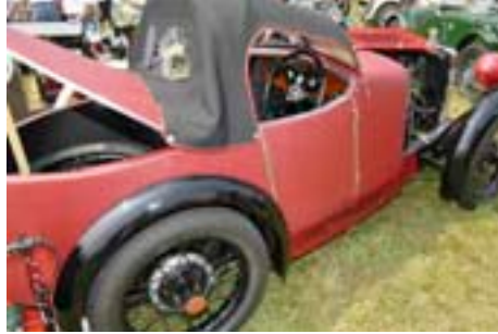
M Type Midget