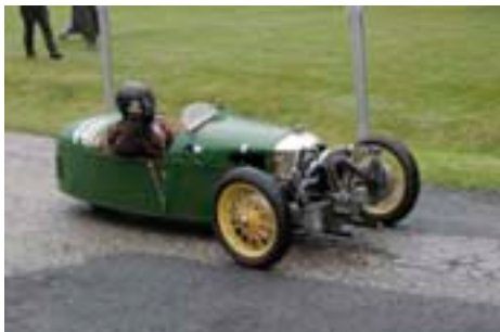
Morgan three wheeler