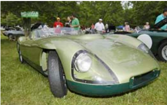
MGA EX186 using Twin Cam running gear