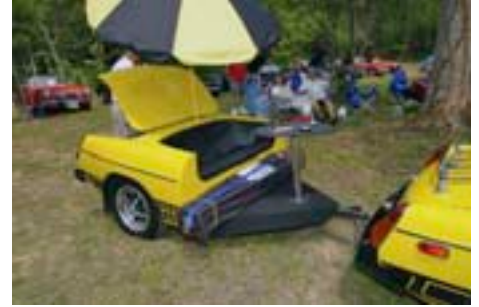
MGB with a B trailer and picnic table