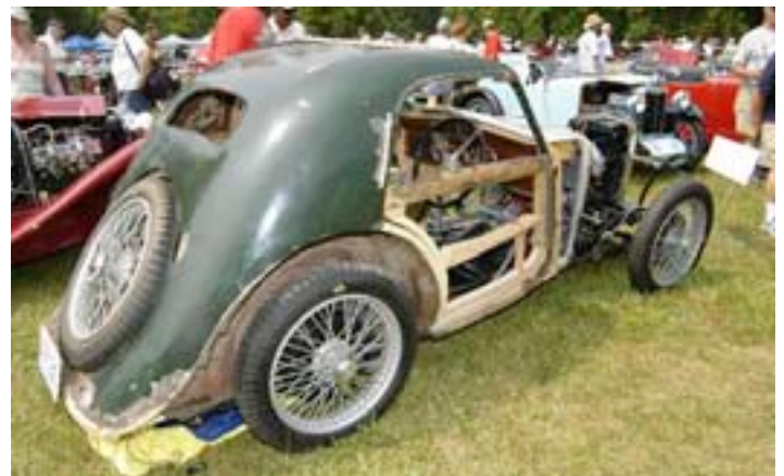
MG PA Midget Airline Coupe in progress