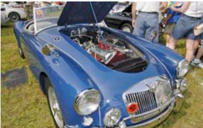
First Place MGA Twin Cam