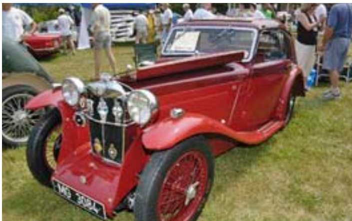
MG PA Midget Airline Coupe (only 28 made)