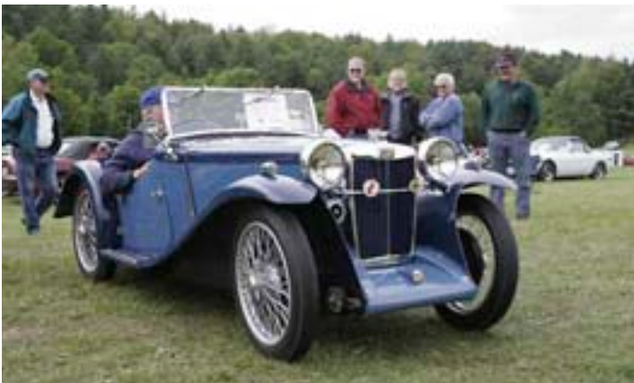
1935 MG PB