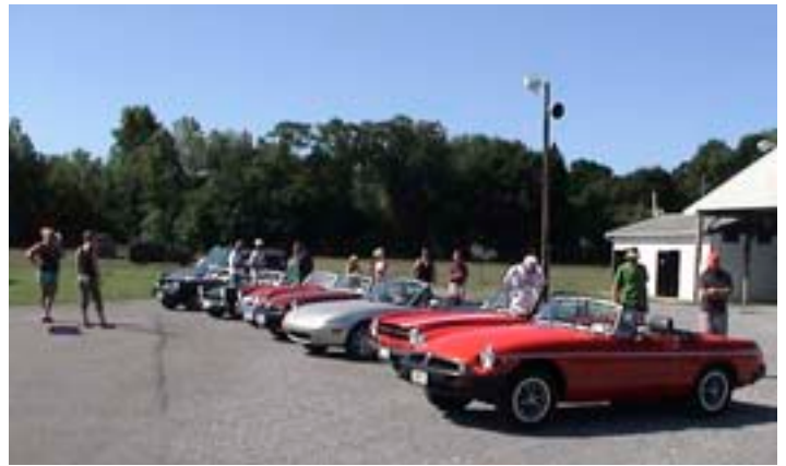
Rallye line up