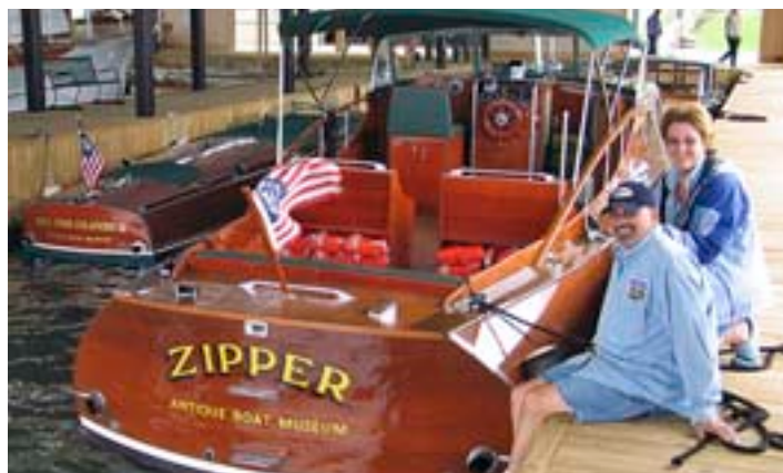
Ziprrrz Racing CEO and CFO dreaming about a new acquisition