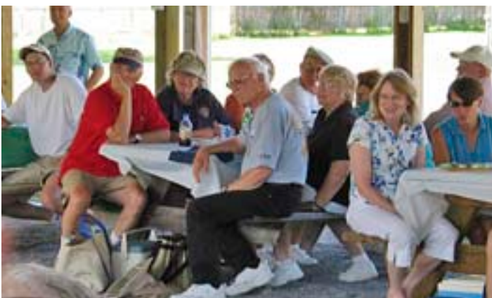
And the rallye winners are . . .