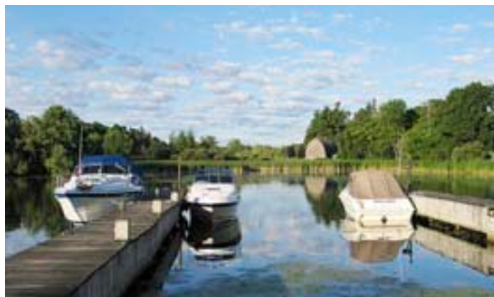
View at the motel — Saturday is Gorgeous!

We had a lot of fun sharing the area and are looking forward to future return trips. ◀