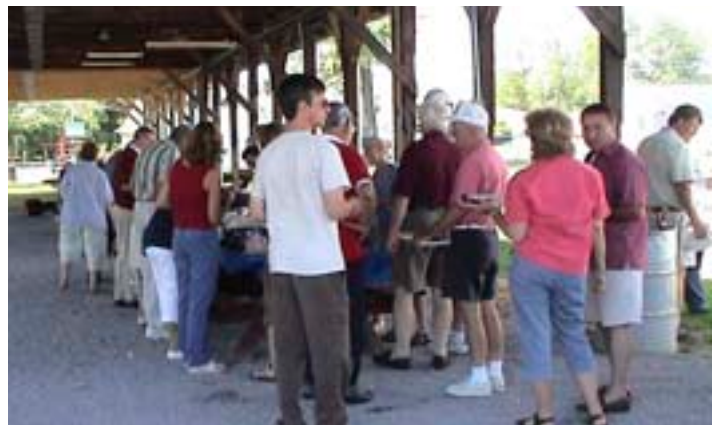
Steaks are ready!