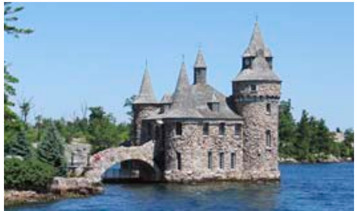
The landing at Boldt Castle