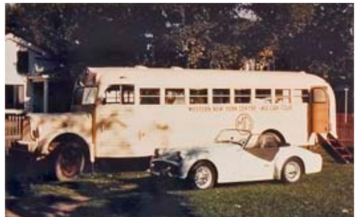
Watkins Glen Express, 1962

Al Costich noted that at one time the MGCC owned a bus for use by the club.