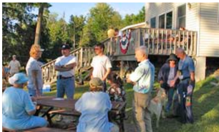
Perfect day for a picnic