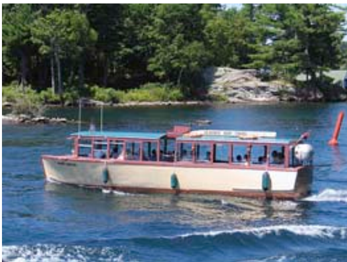
A vintage 1000 Islands tour boat