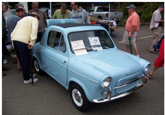
Vespa Car Peoples Choice