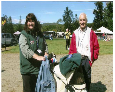
Time to check out the show cars