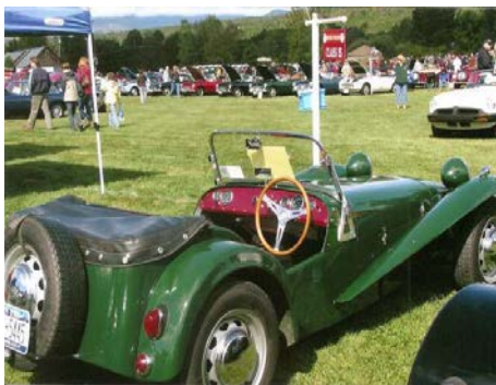
Baldwins 3rd Place Lotus Super 7