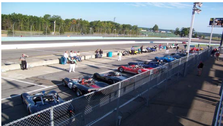
On Track activity