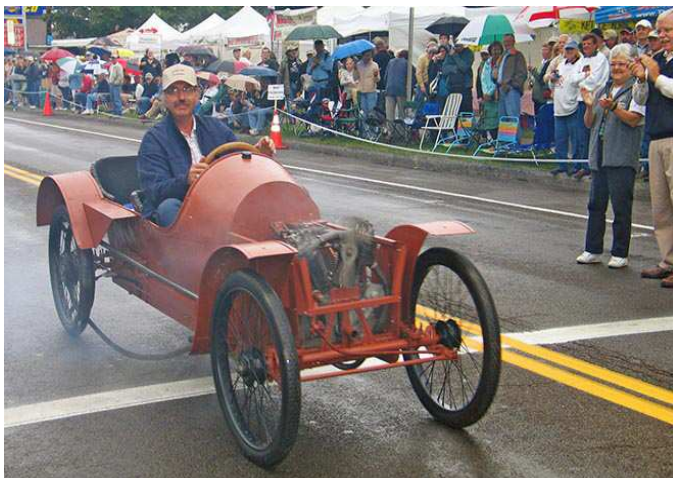
Owego Cycle Car Most Historic