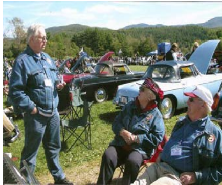
Isn't this just lovely weather