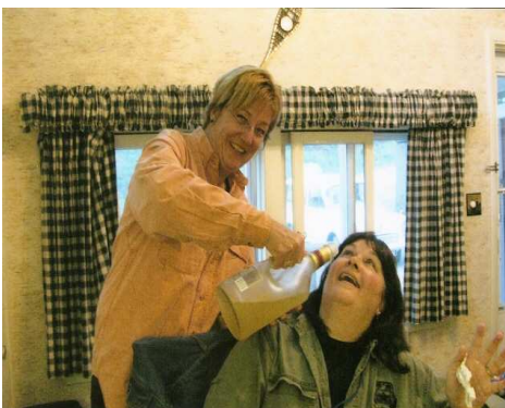
This will help your eye problem