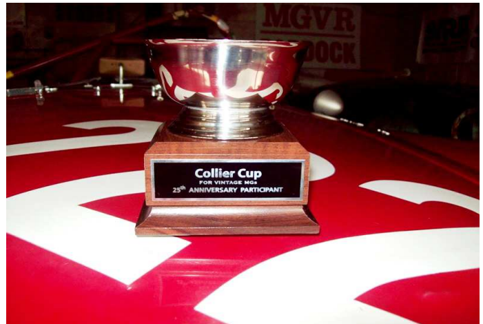
The Collier Cup presented to all MG Racers