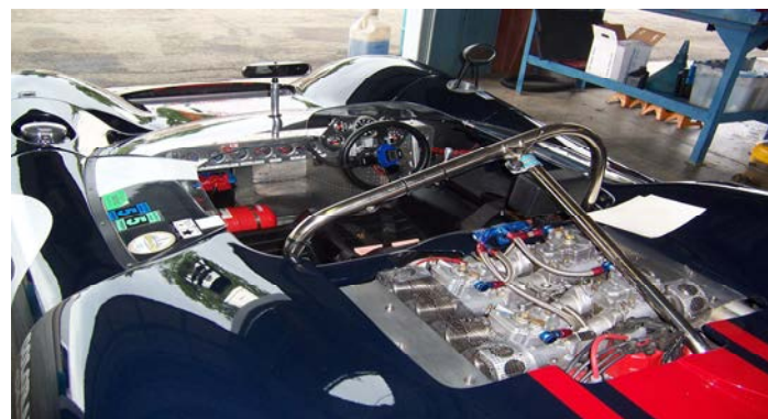
Beauty of the machine