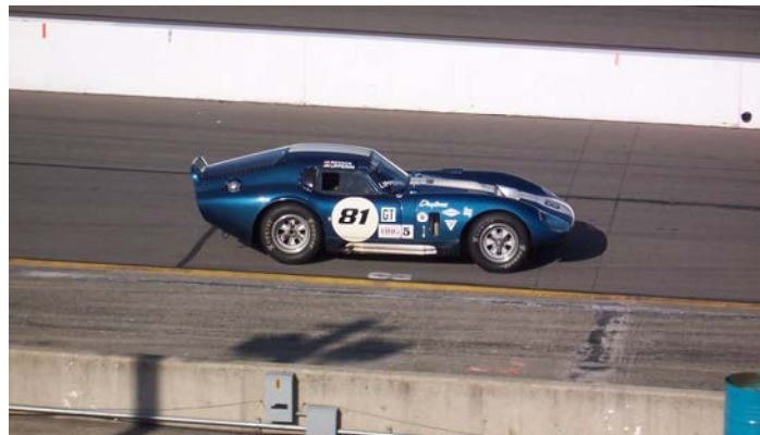
Cobra Daytona Coupe