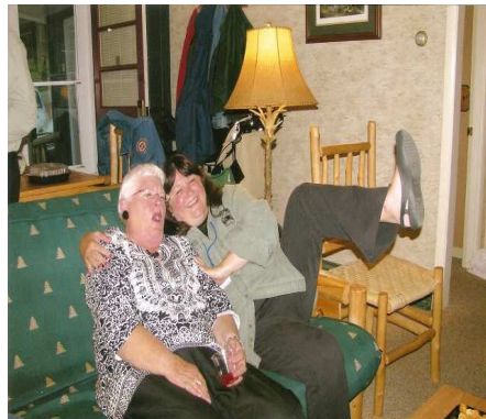
What happens after