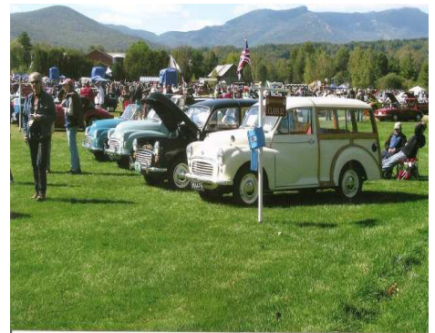
Great cars and Great Scenery