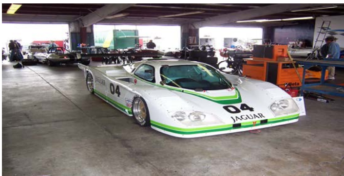
GTP Jaguar XJR