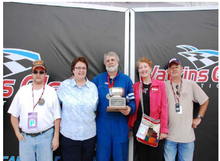
Bill Glanville Memorial Cup Winner (Vanscoy)