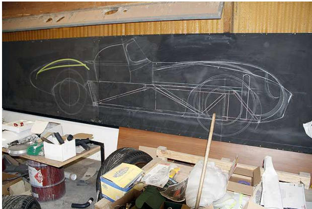
Start with a full scale drawing