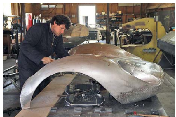
Ferrari P4 front