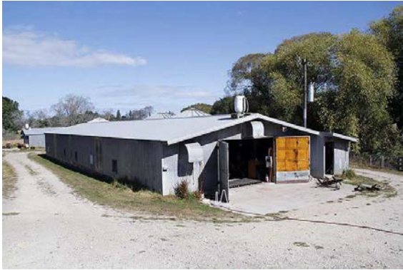
Rod Tempero Motor Body Builder