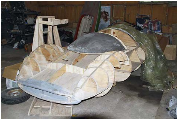
The wood buck for a Ferrari P4