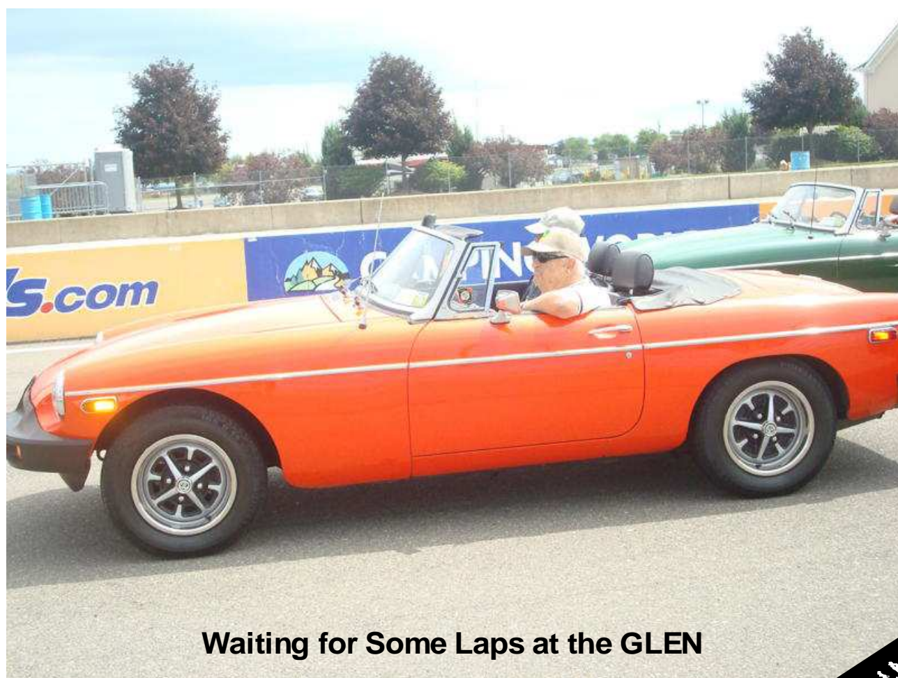
Waiting for Some Laps at the GLEN