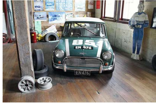
1967 Austin Cooper S