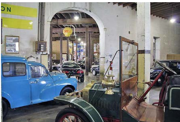
Oamaru Auto Collection