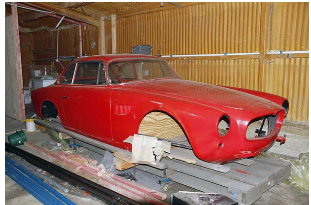
1957 Maserati A6G 2000 body