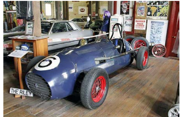
1953 Ransley Riley supercharged 2.5 liter