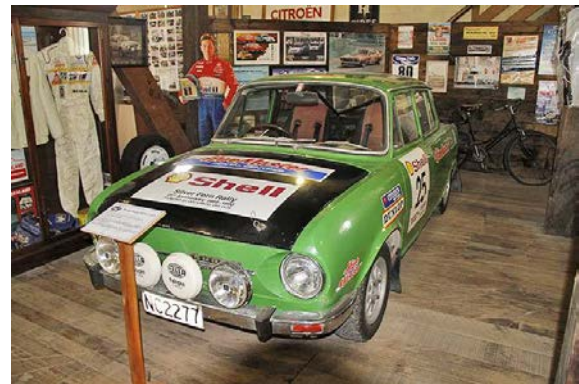
1973 Skoda S110 Rallye