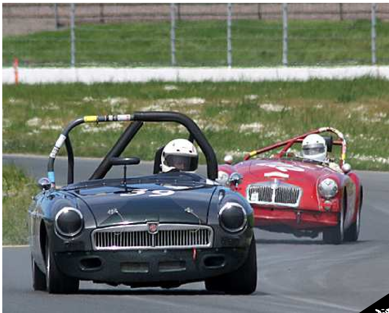
MG Racing at the West Coast Focus Event

50th Anniversary of the MG Motor Club of America