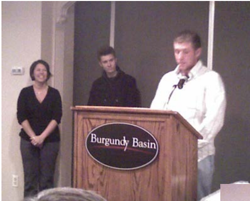
The MCC Scholarship Award