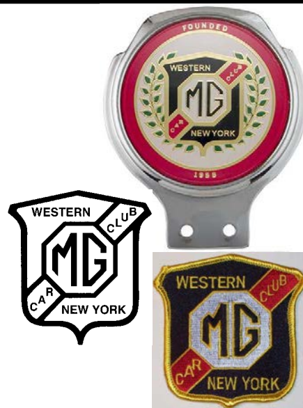
Car Badge Sticker Patch

Sticker, Black/Silver ..... $1.50 50th Anniversary Sticker ..... $1.50 MGCC Mug.....$5.00 Car Badge.....$20.00 Badge Clip .....$5.00 Patch embroidered .....$2.50 Key Fob, large leather..... $4.00 Pin, cloisonné.....$3.00 Dash Plaque, 40th Anniv.....$2.00 Sticker, front adhesive.....$1.50 Sign, magnetic (10").....$15.00 Bumper Sticker .....$1.00 Name Badge w/MG.....$15.00 Vehicle Log Book .....$5.00 Fire Extinguisher .....$15.00