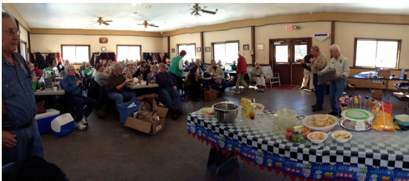
A Spring get together at the Steak Roast