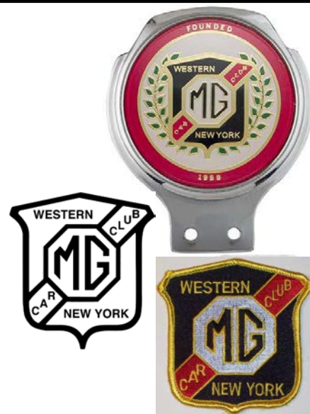
Sticker Car Badge Patch

50th Anniversary Badge ..... $20.00 50th Anniversary Pin ..... $3.00