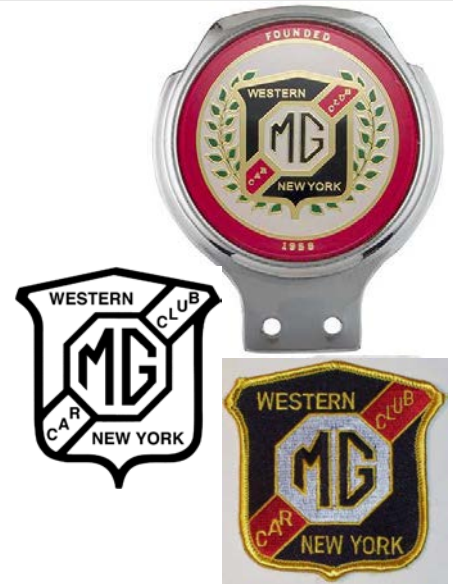
Sticker Car Badge Patch

Also available is a wide selection of clothing items (shirts, jackets, ect.) embroidered with the club logo. Prices shown are for members only. All items are available for purchase at our monthly