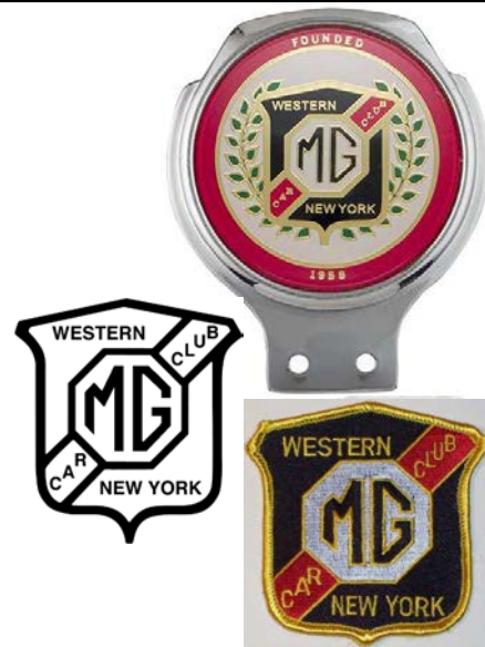
Sticker Car Badge Patch

Also available is a wide selection of clothing items (shirts, jackets, ect.) embroidered with the club logo. Prices shown are for members only. All items are available for purchase at our monthly