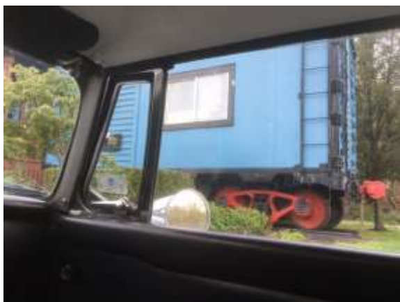
2021-43 A view of a train out the window of George Heissenberger's MGB!