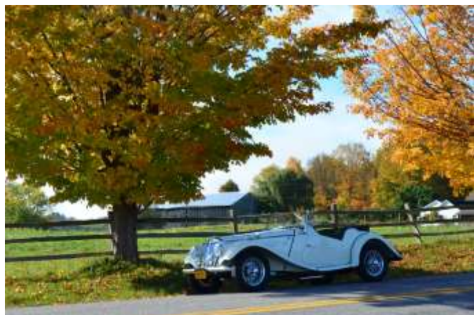
2021-41 Mike Robinson's MG TF with splendid fall foliage