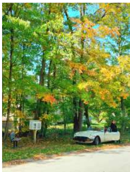
2021-41 Barbara Zak with an even BETTER bit of fall foliage (just one photo counts!)