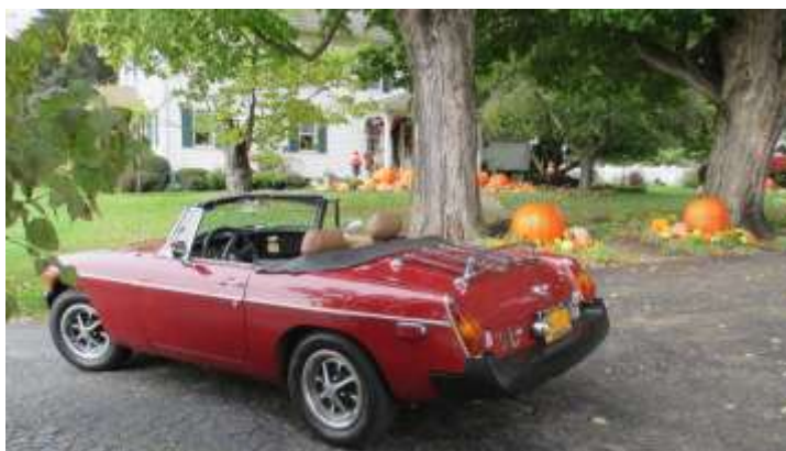
2021-42 The Goodwins' MGB with a whole bunch o' pumpkins