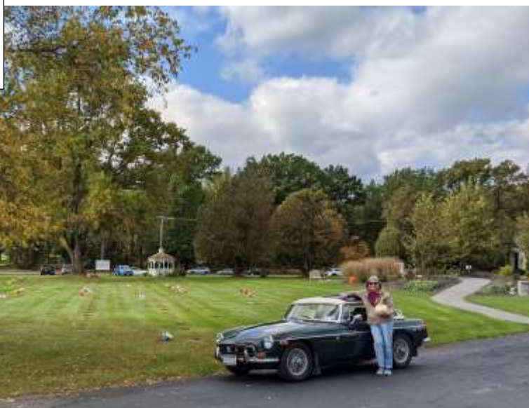
2021-44 Combination! Doreena Hames with a pumpkin at a cemetery with a gazebo, with the MG in the shade of a tree sporting lovely fall foliage