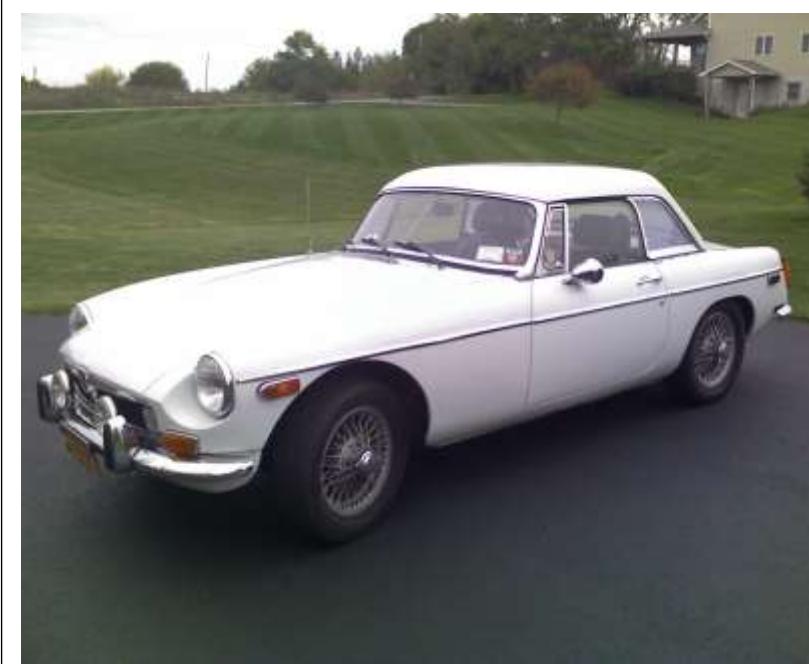
Factory hardtop

codes on the rear window glass and I believe the hardtop is from 1966. The setscrews that hold the side window frames together won’t budge so I will have to drill out all the screws and re-tap them to replace the side glass. So, I instead used a headlight cleaning kit to polish up the Plexiglas side windows and for now that’s as far as I am going. The back window is real glass and in great shape so no need to replace that. I got all new rubber seals from Macgregor in Canada and have been happy with the fit and look. Shortly after getting the hardtop finished and mounted on the car, I decided to try an