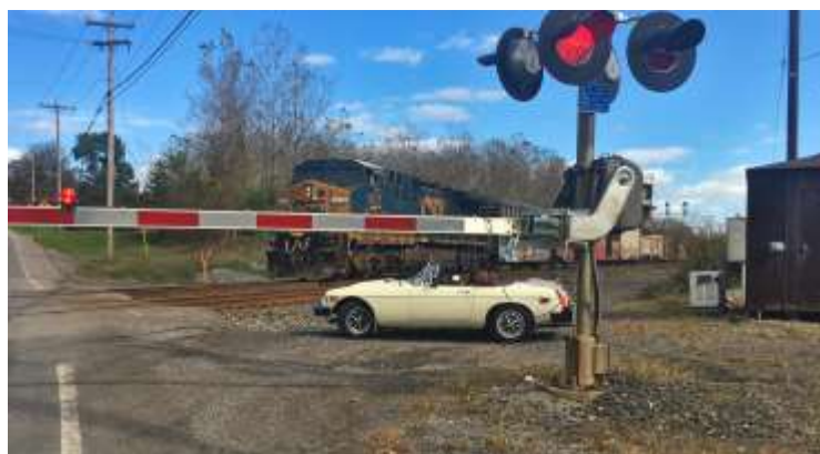
2021-43 Barbara & Leon Zak timed it just right to capture this train heading into the crossing with their MGB parked on the track side of the gate!