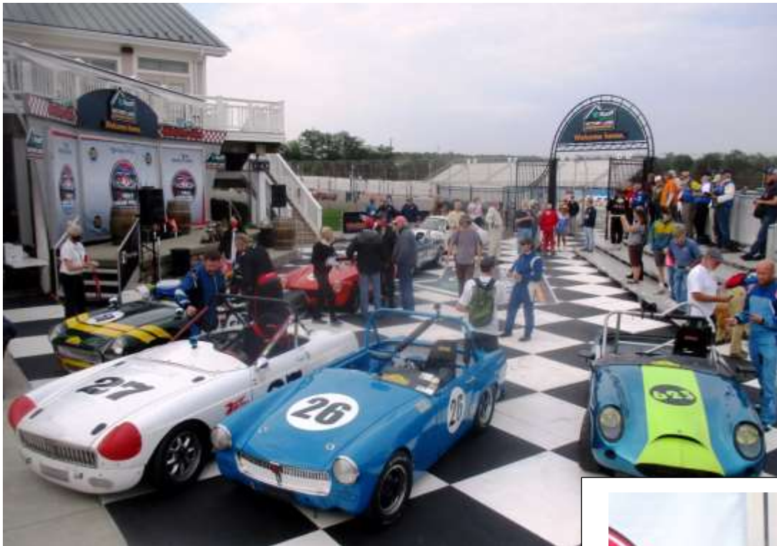
Collier Cup Awards at Victory Lane

A couple of photos submitted to Spokes from the Vintage Racing weekend at Watkins Glen (back in September) found their way into the Spokes spam folder inadvertently. We recovered them, and are happy to share them here now, with apologies to photographer Richard Powers.