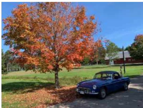
2021-41 Ev and Ron Stone found a very nice maple that looks good with their MGB