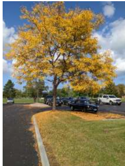
2021-41 The Hameses' MGB with lovely golden foliage