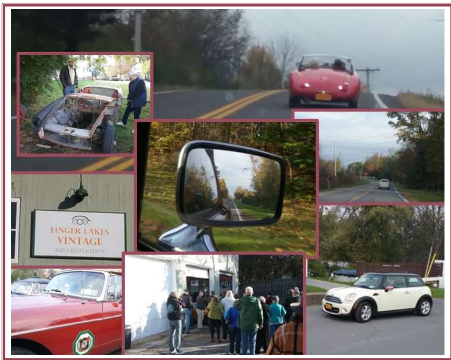
2021 Fall Foliage Tour