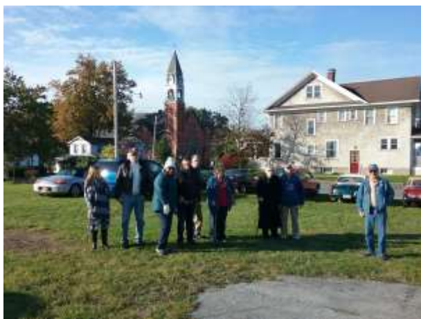
2021-44 Combination! 3 old men, 3 old ladies, 3 British cars, and fall foliage with the Goodwins' MGB (far right)

More October photos by contest participants