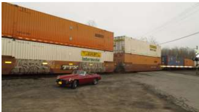
2021-43 The Goodwins' MGB scarily close to a thundering train at a junction