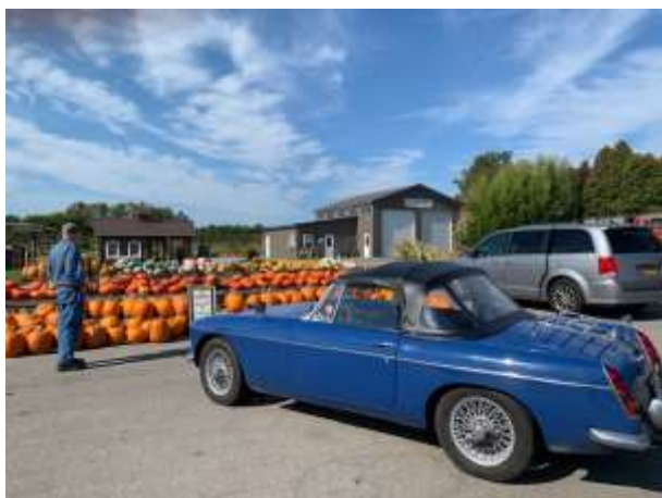
2021-42 Ev and Ron Stone's MGB with pumpkins as far as the eye can see