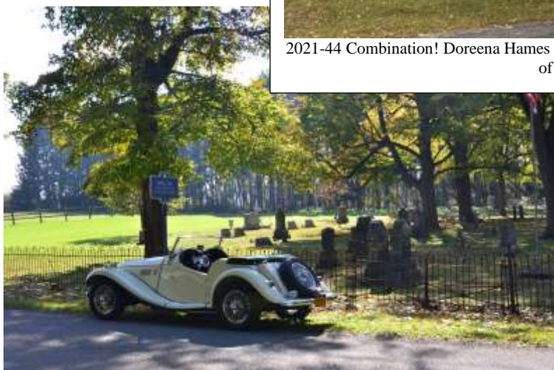
2021-44 Combination! The Robinsons' TF in the shade of fall foliage trees at a cemetery with a NY State historical marker