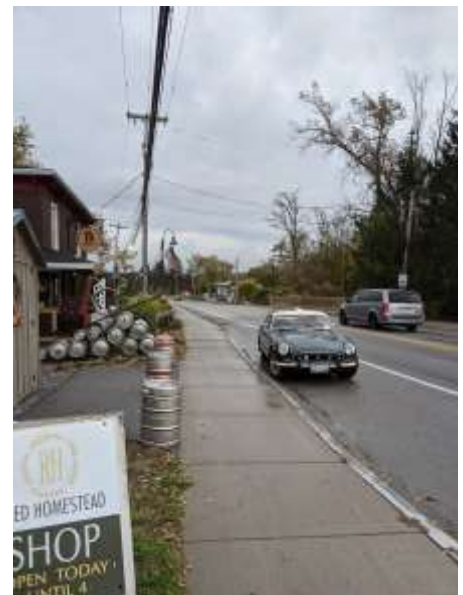
2021-22 The Hameses' MGB at a 3 rd brewery