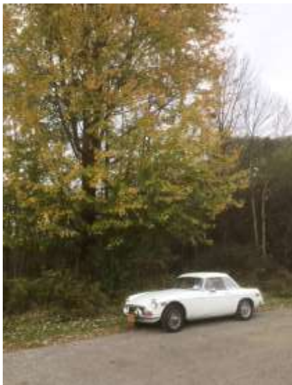
2021-41 George Heissenberger's MGB with fall foliage