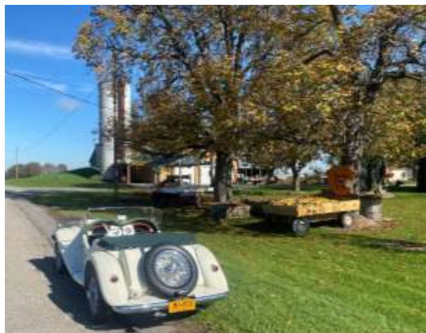
2021-44 Alternate Combination! Robinsons' TF at a farmstand with many pumpkins, and a barn with a silo and nice fall foliage

For one more combination photo, please see the final page of this Spokes issue!