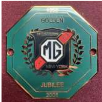
50 th Ann. Badge $20.00