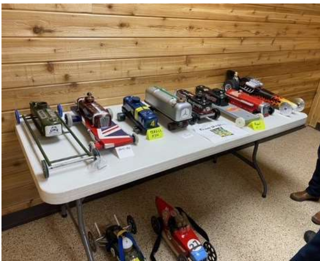
Assortment of valve cover racers, each one made from an actual British car valve cover