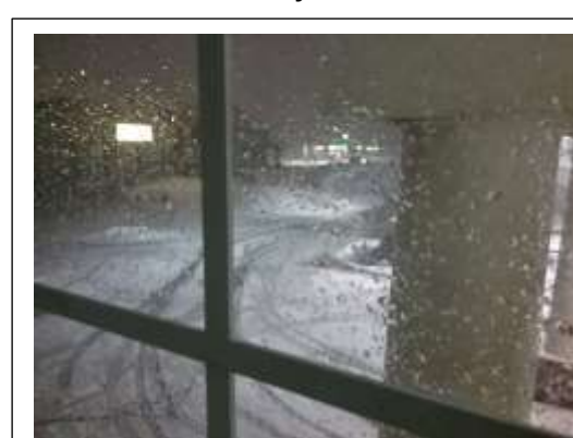
Three nights stuck in Rock Springs, Wyoming

convoy of big rigs and cars were on their way. We finally got to Colorado but cut our stay shorter by a couple of days to make sure we could get back through the