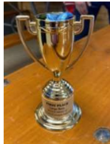
First place trophy