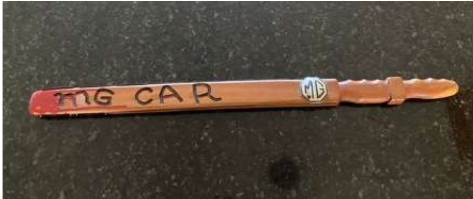
MG Car "Club"

screaming ensued! On another rally an instruction called for participants to reach into a old toilet bowl full of gummy worms to retrieve some trinket needed for points. Yuk, the things we did for rally points. We