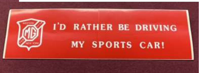
Bumper Sticker $1.00 / 3 for $2.00

ONE Sticker FREE with any purchase over $20.