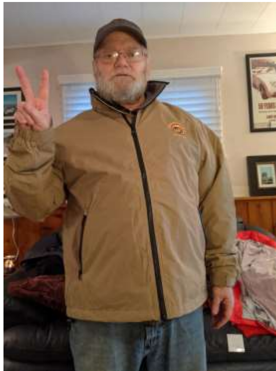
Patriot Jacket W/ fleece lining & no hood

contact Joe B at blitz7711@gmail.com or at 585-749-9263.