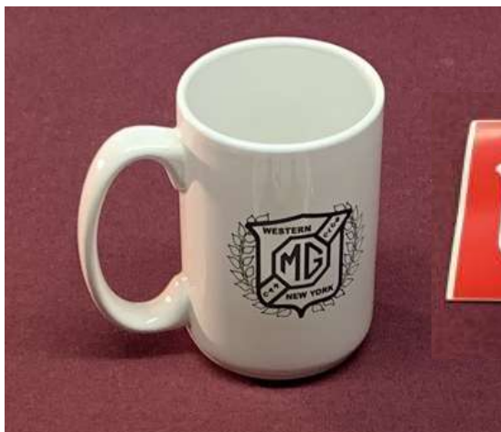
Coffee Mug $5.00