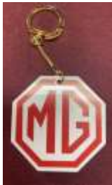
Octagon Key Ring $1.50