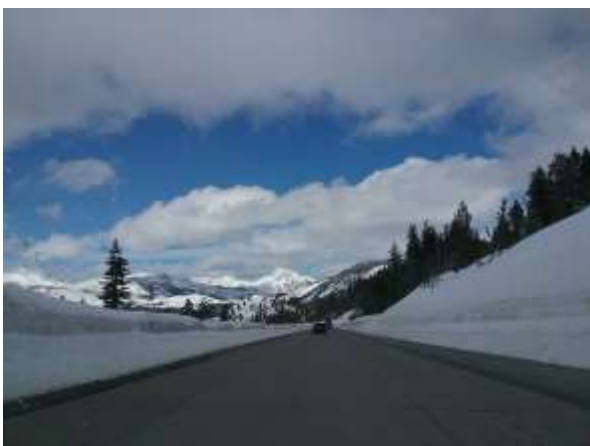
Driving through Donner Pass, Sierra Nevada