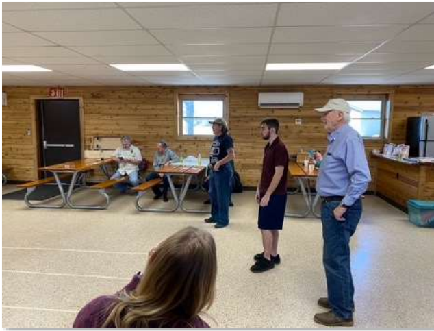
All-important catchers ready for the cars