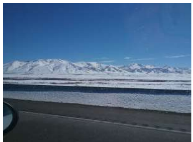
Clear skies in Nevada!