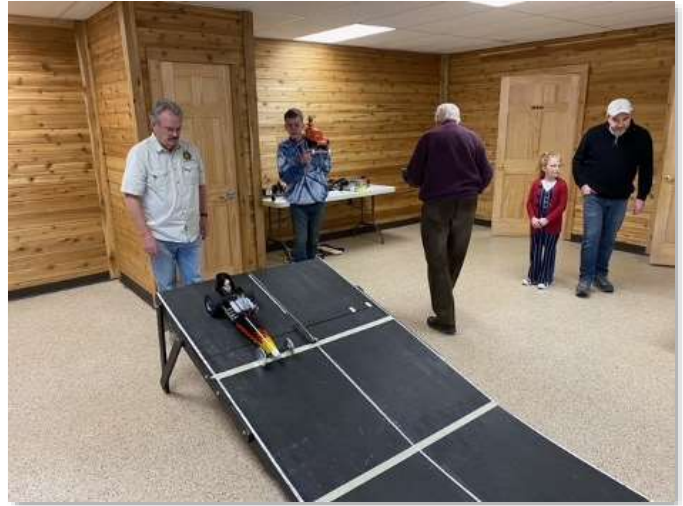
Testing the cars for how straight they will run

Attendees arrived at 1:00 pm and after registration and checking the entrants, the races began at 1:30pm with double elimination bracket racing until the winners were declared. In addition to the first through third place winners in both small and large bore, there was a people's choice award. In addition, lots of food in the form of appetizers and desserts were in abundance (plus beverages) so there was enough to entertain the non-racers as well as the racers themselves. The club provided coffee and hot water for tea.