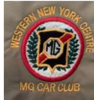
Closeup of Actual Embroidery of Logo

Color Choice: Not all colors may be available do to supply chain shortages. Feel Free in emailing me if you have a color you want me to check on at blitz7711@gmail.com