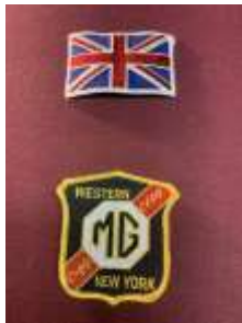
Embroidered patches $2.50