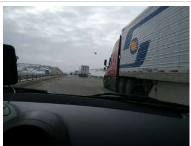
The convoy finally hits the road again in Wyoming

convoy of big rigs and cars were on their way. We finally got to Colorado but cut our stay shorter by a couple of days to make sure we could get back through the