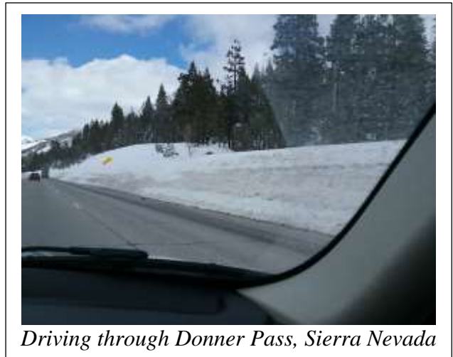
Driving through Donner Pass, Sierra Nevada

Traveling in the western U.S. this year has not been easy with all the snow, rain and flooding going on. We canceled our planned trip to Los Angeles because of all the bad weather. We also strategically planned our three-day trip to Colorado to see the grandkids between storms, making sure we could get through the Donner Pass in California's Sierra Nevada Mountains on Interstate 80. We got through California, Nevada and Utah okay but when we got to Wyoming things all changed. A one-night planned stay turned into three; Interstate 80 had closed throughout the whole state. But what a mass exodus when on day three the interstate opened, and a