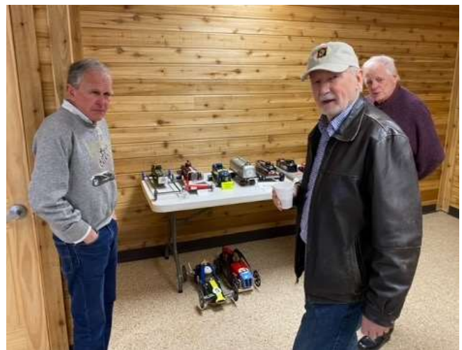
Racers eyeing up the competition between heats