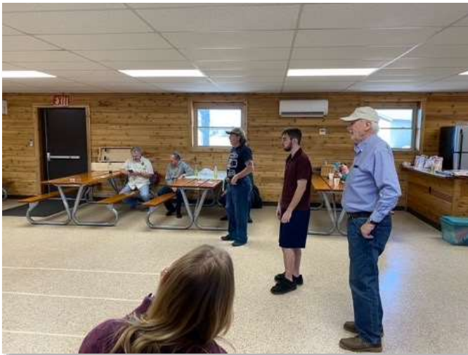
All-important catchers ready for the cars