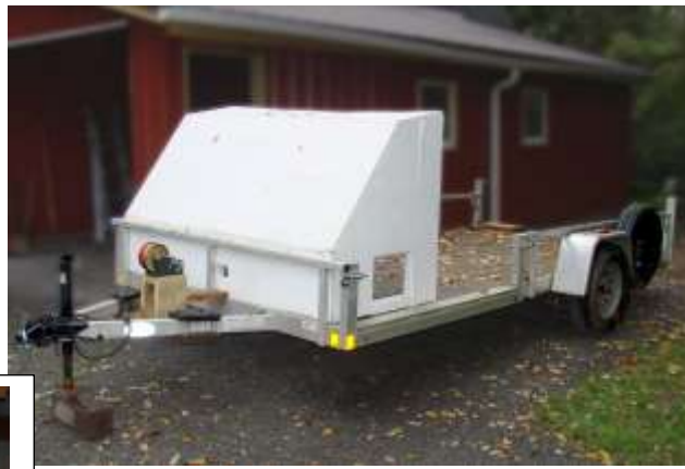
Trailer, with a winch!