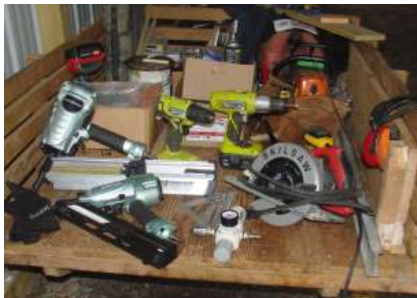
Construction tools - see below