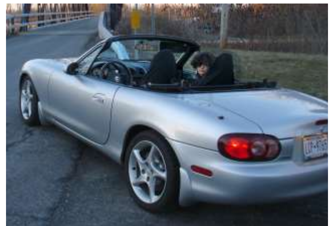
A "Japanese MG" for longer, faster trips!