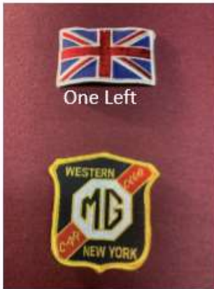
Embroidered patches $3.00