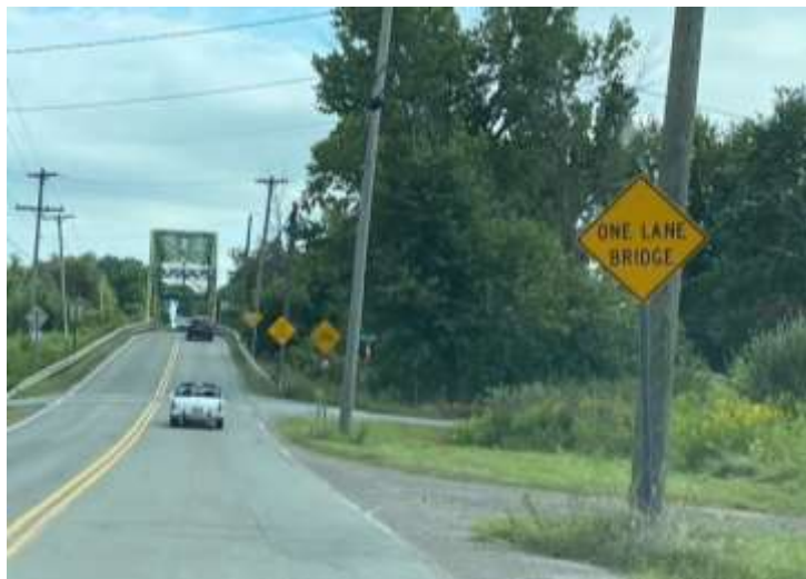
Destination #04 – One-Lane Bridge - Heissenberger