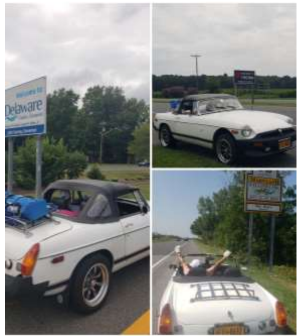
Destination #64 – Outside of NY State - LiMuti