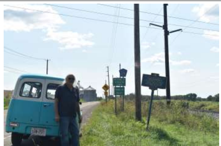
Destination #10 – NYS Historic Marker - Zak