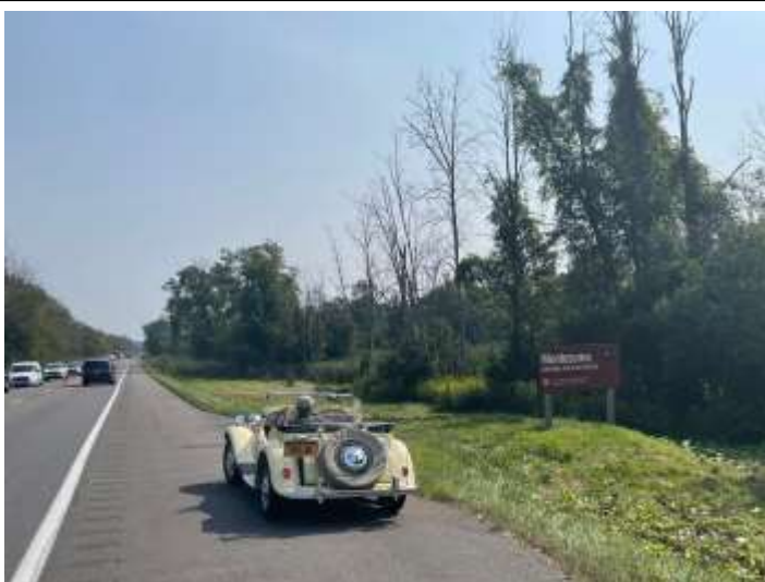
Destination #07 – Wildlife Preserve – Black