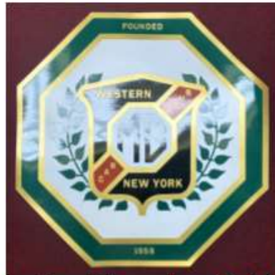
Limited Supply – 2 left 10" Magnetic Sign $15.00