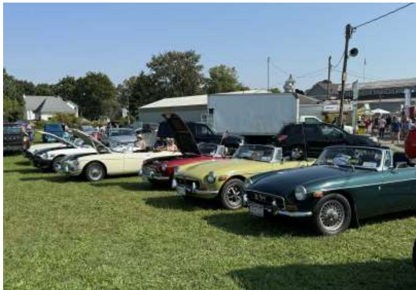
A bunch of B's at the Palmyra car show