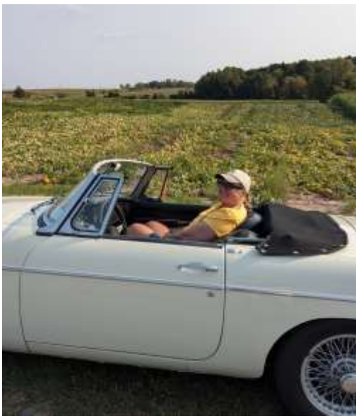
Destination #35 – Pumpkin Field - Kray