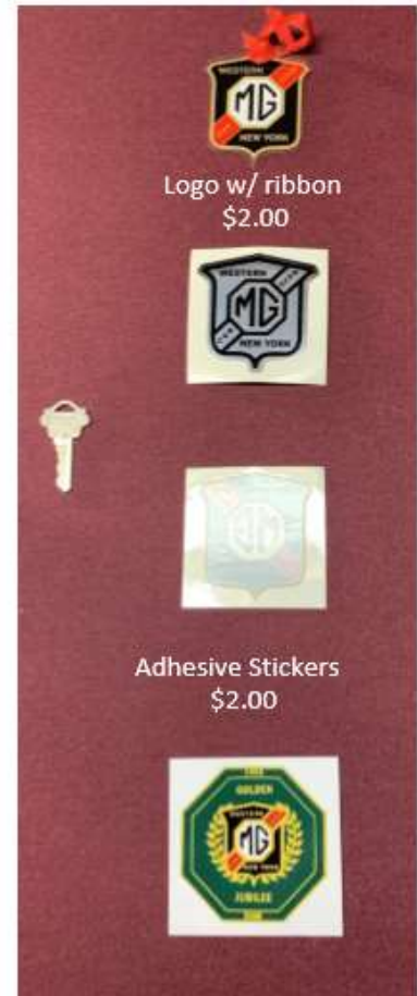
Logo w/ ribbon $2.00