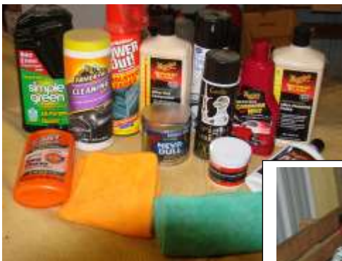
Shine 'em up stuff