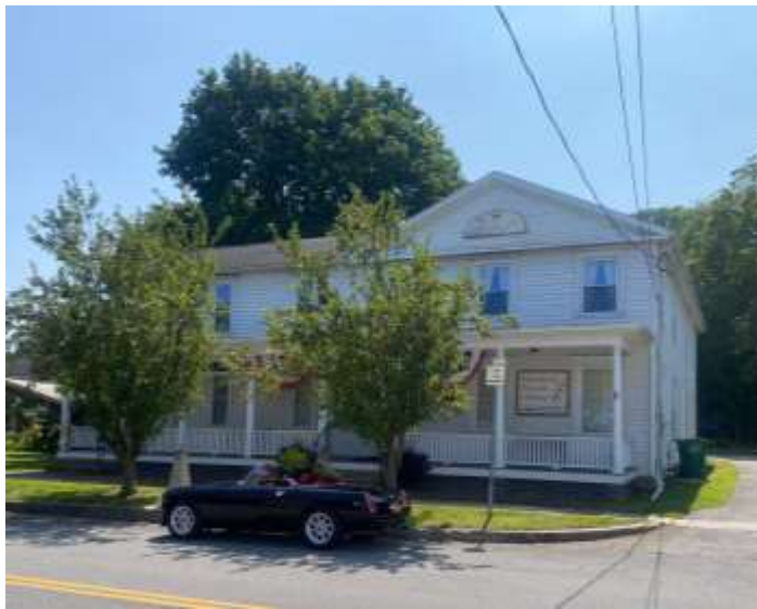
Destination #24 – Library - Robinson