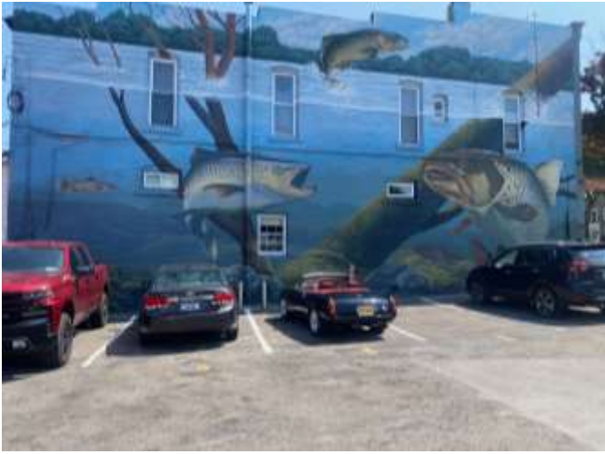
Destination #16 – Mural Painted on a Building - Robinson