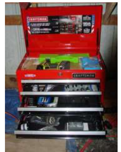
Nice new tool chest, and tools!