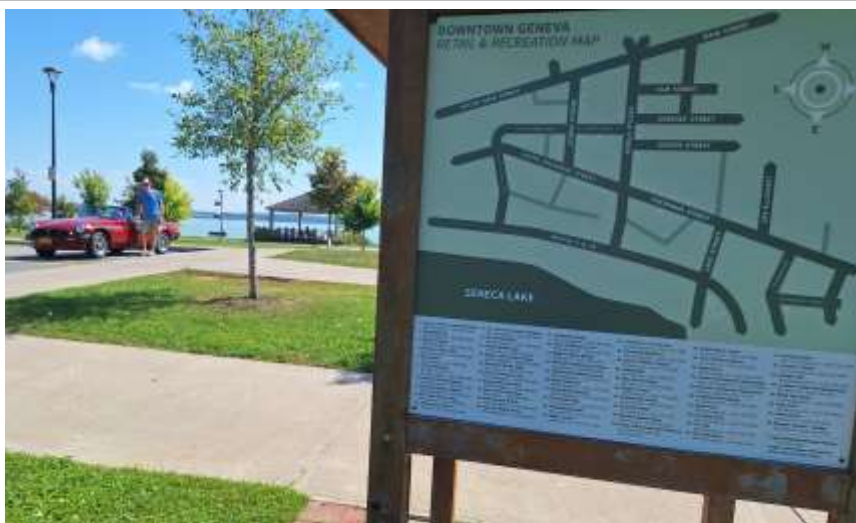
Destination #43 – a Finger Lake with Sign- Goodwin