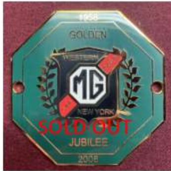
50 th Ann. Badge