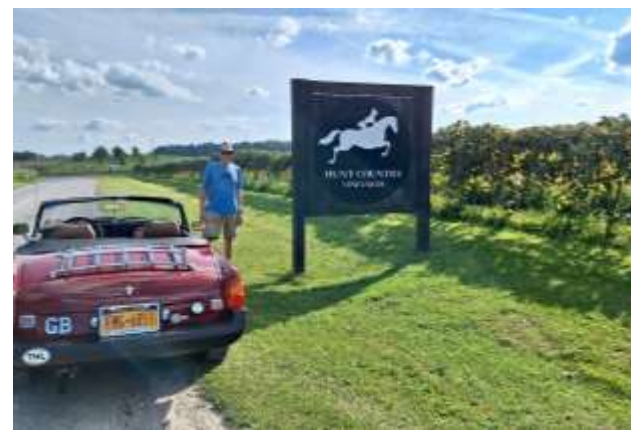
Destination #32 – a Finger Lakes Winery - Goodwin