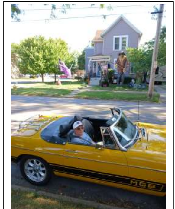
Destination #37 – Halloween Decorations - Illig