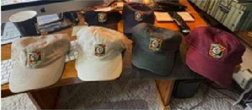
Closeup of Actual Embroidery of Logo for Hats

MG Car Club of Western NY Centre $18. each Port & Co & New Era – all are embroidered