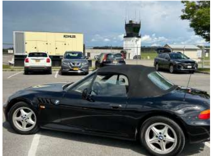
Destination #21 – Airport Control Tower - Boughton