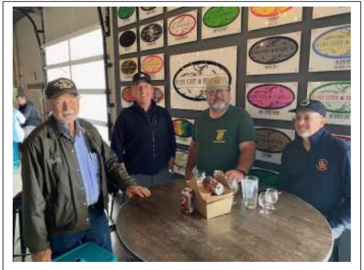
Our club at Rising Storm brewing