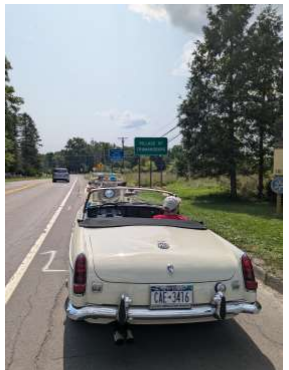
Destination #62 – Village Starting with a "T" – Kray (with Black)