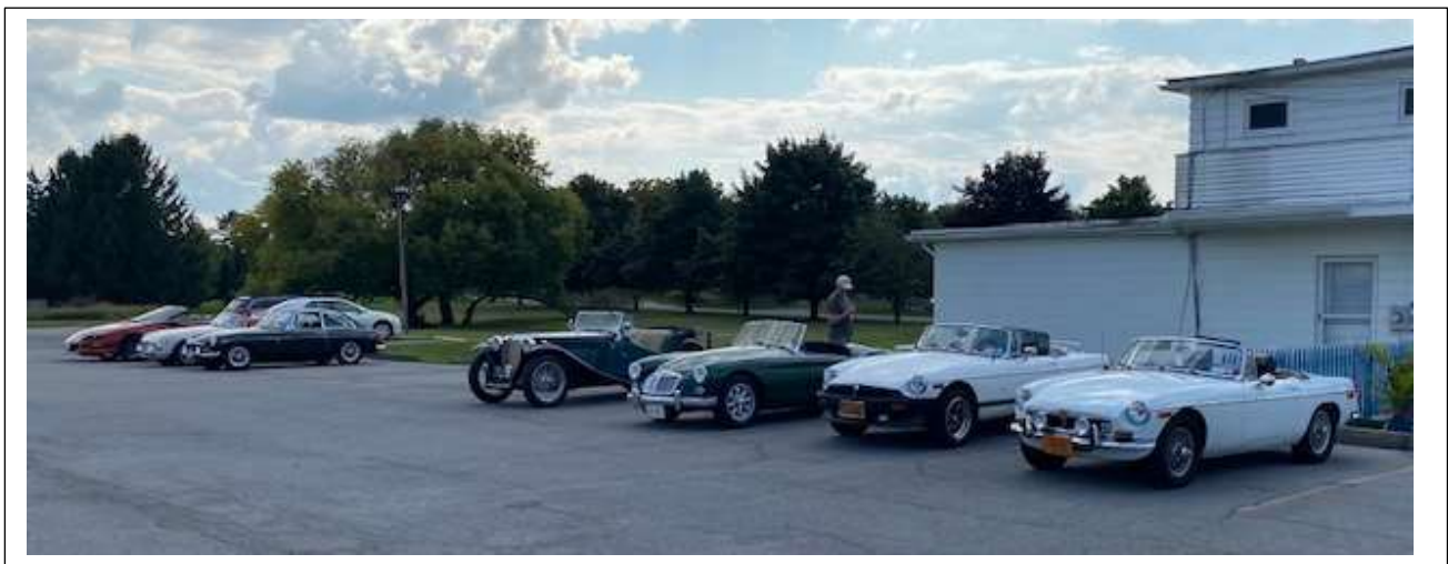
Group of members' cars at OKAY Brewing