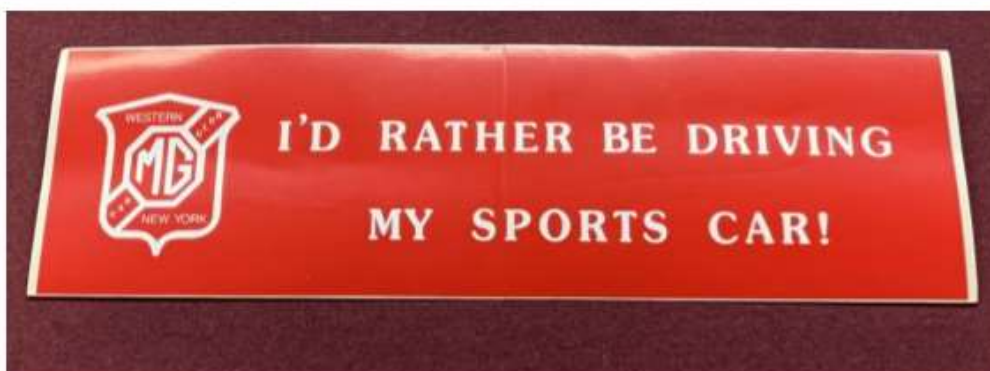
Bumper Sticker $1.00 / 3 for $2.00

ONE Sticker FREE with any purchase over $20.